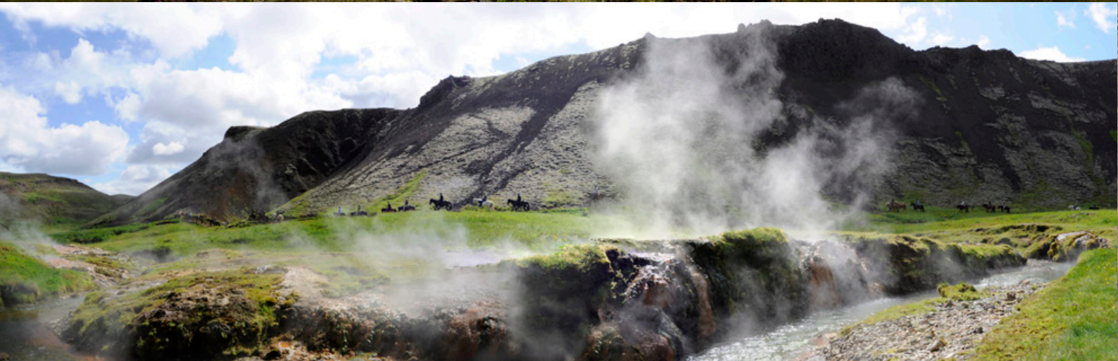
The Valley Reykjadalur – A Hidden Paradise!