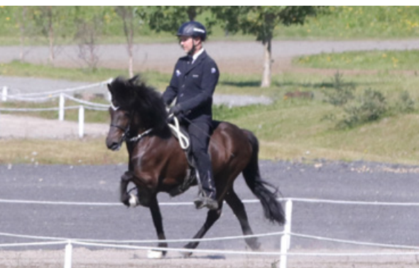
Vallarsól from Vellir