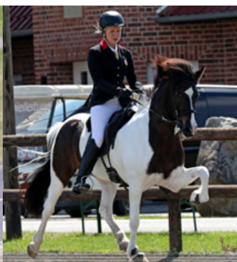
Hvammur from Vellir