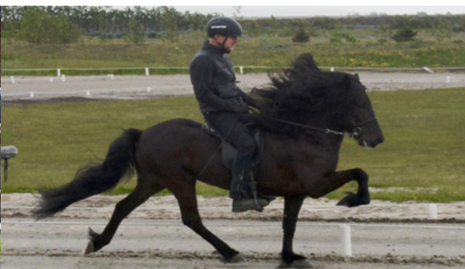
Hjör from Vellir