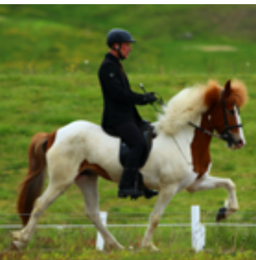
Óðný from Vellir