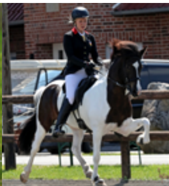
Hvammur from Vellir