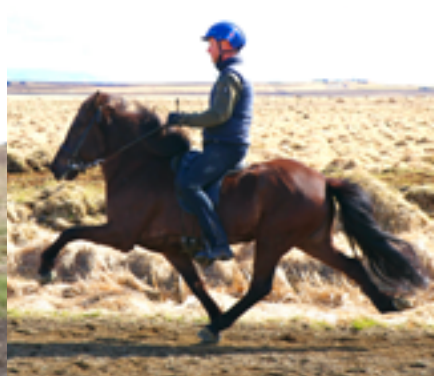
Nett from Vellir