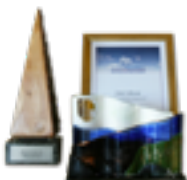
In 2011 Eldhestar won both the environmental award issued by the Tourist Board of Iceland and the Municipality of Ölfus.